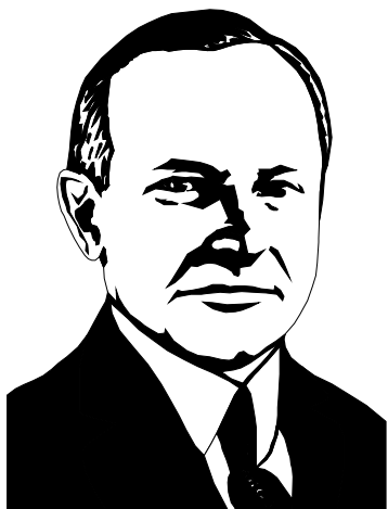
President Calvin Coolidge

The Republican Congress cut income tax rates and increased tariffs. At least some of what people saved in taxes was invested in the stock market, causing an upsurge in prices. The new heads of regulatory agencies were more lenient toward big business than the Democrats and Progressives had been. Commerce Secretary Hoover encouraged trade associations, in which businesses shared ideas about cost-cutting, marketing, and other activities. The Supreme Court, led by Harding-nominated William Howard Taft, struck down a federal law regulating child labor and ruled against some of the federal regulatory agencies. However, Mellon did balance the federal budget and decrease the national debt. The overall trend was toward a stronger national economy.