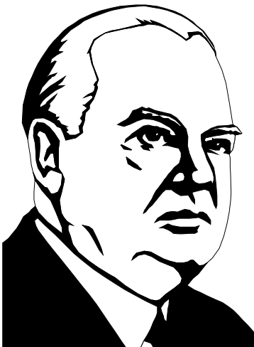
President Herbert Hoover

Hoover even carried Smith's home state of New York. With no Progressive candidate, Smith did, however, almost double the vote that Democrat John Davis received in 1924. The New York governor's candidacy helped build the urban base of the Democratic Party that it has today.