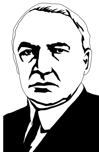
President Warren Harding

It was revealed in 1923 that the head of the new Veterans Bureau was robbing the government of medical supplies. He resigned and fled to Europe. Two men either in or close to the administration committed suicide when questionable dealings started to surface. Attorney General Daugherty barely escaped indictment over mishandling German war reparation payments. The biggest scandal involved government-held oil deposits in a place in Wyoming called Teapot Dome. Interior Secretary Fall allowed private companies to tap into the deposits secretly without making competitive bids for the rights. Fall's personal standard of living dramatically improved while this was going on, and he eventually went to jail for taking bribes even though he always denied that he had done anything wrong. Many of the scandals that took place during Harding's tenure only came to light after the president's death.