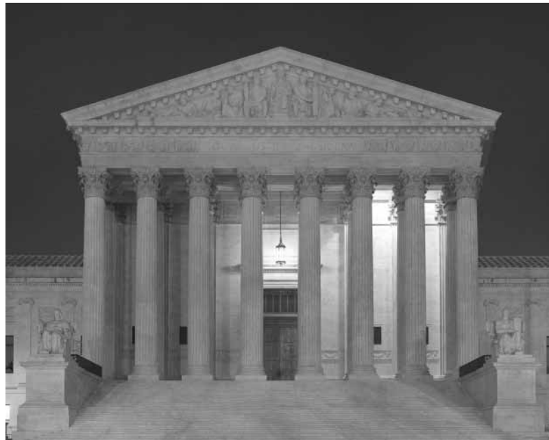
U.S. Supreme Court Building, Washington, D.C.