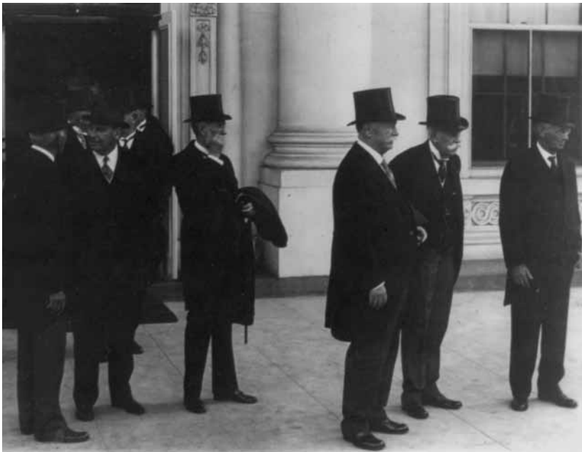
Justices of the U.S. Supreme Court, 1929

ready for an opinion to be written, he will assign the writing of it to one of the justices or he will take the responsibility for it himself. Separate or concurring opinions can also be written, as well as dissenting opinions by those who disagree with the majority. Dissenting opinions can sometimes influence decisions in later cases in which earlier, majority opinions