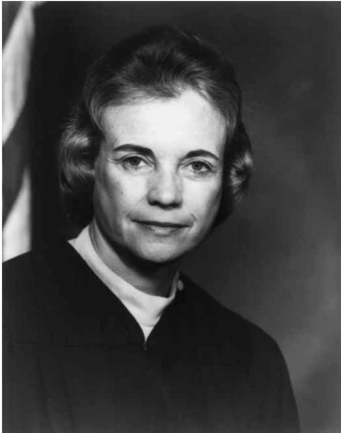
Justice Sandra Day O'Connor

American law and society. Its decisions ended state-sponsored racial segregation, brought about reapportionment in the U.S. House of Representatives and in state legislatures, granted