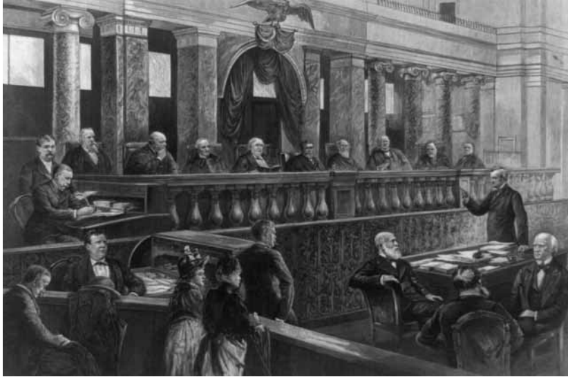
The U.S. Supreme Court, 1888

The Court cannot simply decide to declare its position on a topic. It only speaks when a particular case is brought before it that raises a constitutional issue. The Court tries to answer