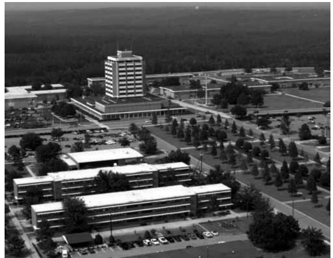
Fort Gillem Military Base near Atlanta, Georgia

When the policy is complicated and is used to accomplish purposes other than generating needed revenue, it can adversely affect many people.