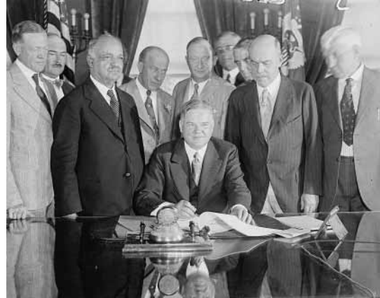
President Herbert Hoover Signing the Farm Relief Bill, 1929

Today, few question whether a government should undertake the programs that it does. With this outlook, it is no wonder that our taxes are getting higher and higher.