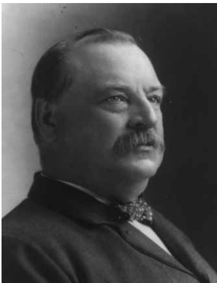
President Grover Cleveland