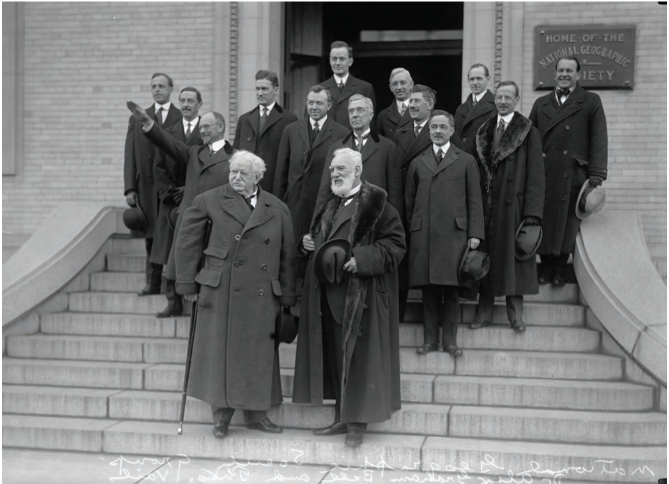
Bell (front right) and Watson (behind him) celebrate the 40th anniversary of the telephone at the home of the National Geographic Society.

at all. We carried out this plan and the entire conversation was published in parallel columns in the next morning's Advertiser , as the latest startling scientific achievement. Infatuated with the joy of talking over an actual telegraph wire, we kept up our conversation until long after midnight. It was a very happy boy that traveled back to Boston in the small hours with the telephone under his arm done up in a newspaper. Bell had taken his record to the newspaper office and was not at the laboratory when I arrived there, but when he came in there ensued a jubilation and war dance that elicited next morning from our landlady, who wasn't at all scientific in her tastes, the remark that we'd have to vacate if we didn't make less noise nights.