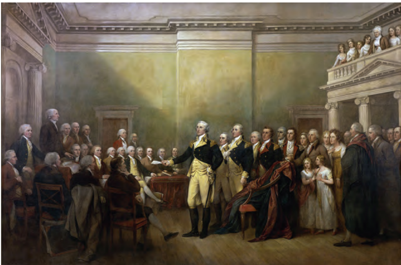
Washington Resigning His Commission in the Army

Impressed with the liveliest sensibility on this pleasing occasion, I will claim the indulgence of dilating the more copiously on the subjects of our mutual felicitation. When we consider