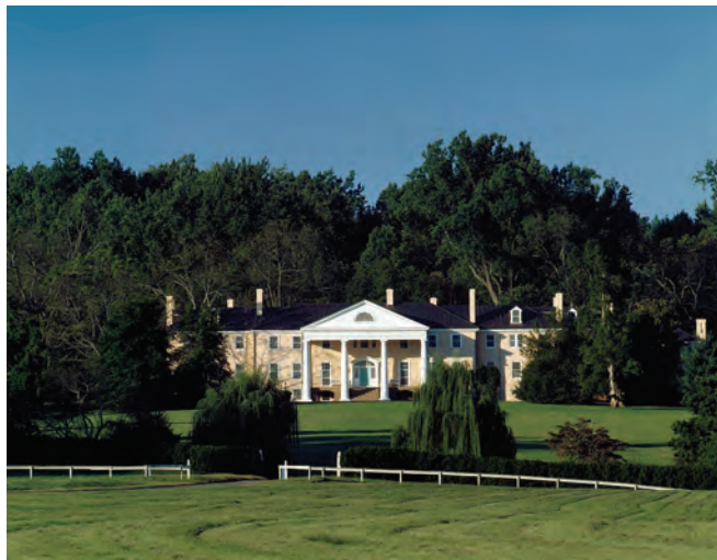
Montpelier, the Home of the Madisons