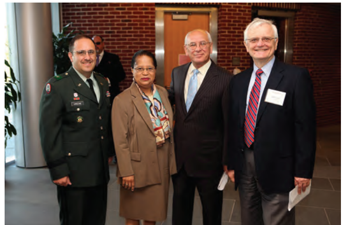
Shirley Ann Jackson at Rensselaer

When Shirley Ann Jackson faced cruel rejection when she asked to study with her classmates, simply because of the color of her skin, she had to choose how she would respond. She could have shown cruelty in return. She could have harbored anger and bitterness. She could have left MIT, saving herself the pain and letting the prejudiced students win. But she believed in another way. When she was a girl, her father taught her, “You can’t control everybody else, and you can’t control the world and everything that happens, but you can have your greatest control—and certainly your greatest influence—by how you control yourself.” Shirley Ann Jackson responded with perseverance. That perseverance opened for Shirley a world of opportunities and a chance to make a difference. She has given many students the gift of knowledge in math and science, developed technologies that impact daily life, made the world safer, and helped give other minority scientists the chance to dream. All because she refused to give up.