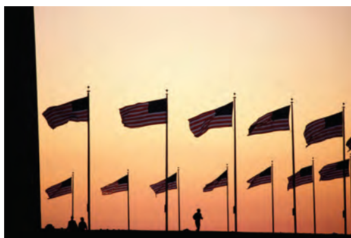
Flags at the Washington Monument