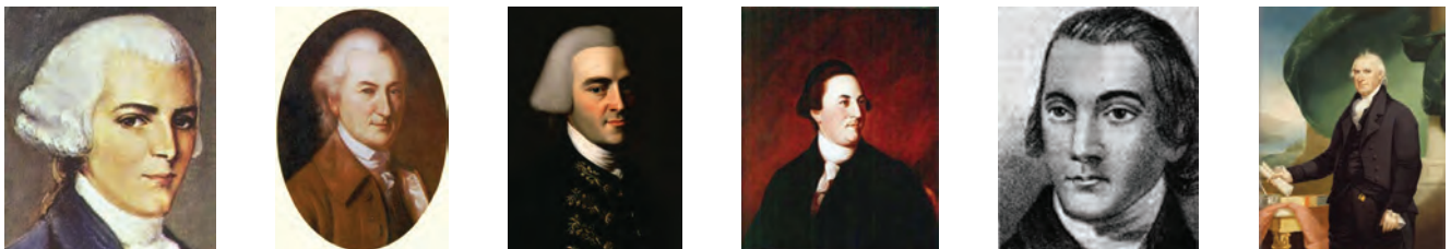
Six of the State Governors in Office in 1783 (from left to right): Benjamin Harrison V of Virginia, John Dickinson of Pennsylvania, John Hancock of Massachusetts, William Paca of Maryland, Lyman Hall of Georgia, and George Clinton of New York.

I now make it my earnest prayer, that God would have you, and the State over which you preside, in his holy protection, that he would incline the hearts of the Citizens to cultivate a spirit of subordination and obedience to Government, to entertain a brotherly affection and love for one another, for their fellow Citizens of the United States at large, and particularly for their brethren who have served in the Field, and finally, that he would most graciously be pleased to dispose us all, to do Justice, to love mercy, and to demean ourselves with that Charity, humility and pacific temper of mind, which were the Characteristics of the Divine Author of our blessed Religion, and without an humble imitation of whose example in these things, we can never hope to be a happy Nation.