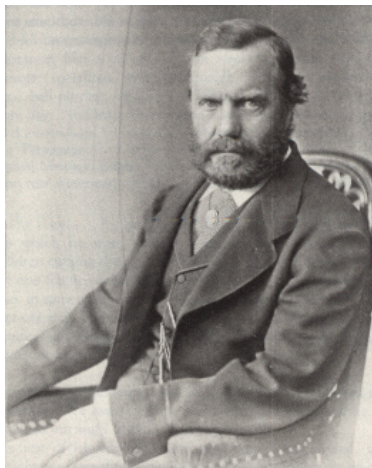
Theodore Roosevelt Sr.