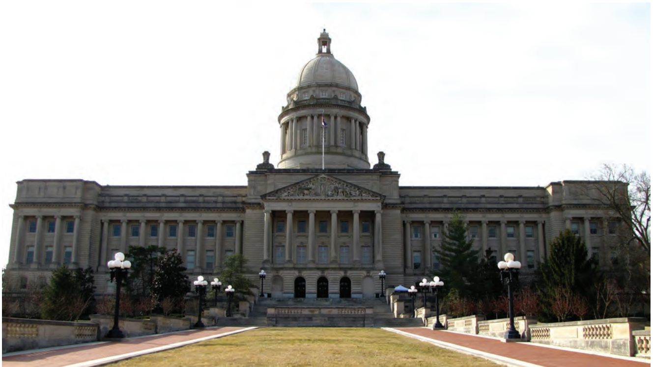
Kentucky State Capitol

. . . The various offices for the departments are commodious and convenient. Nothing that would conduce to the dispatch of business or the comfort of the officials seems to have been overlooked or neglected. After many years of wishing and waiting those who have felt a pride in Kentucky's wealth and greatness are rejoiced that she is no longer ashamed to invite a stranger to visit her Capitol.