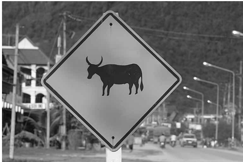
Road sign in southeast Asia