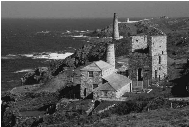
Mine works in Cornwall, England