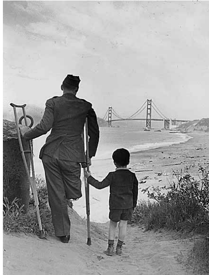
Disabled World War II Veteran